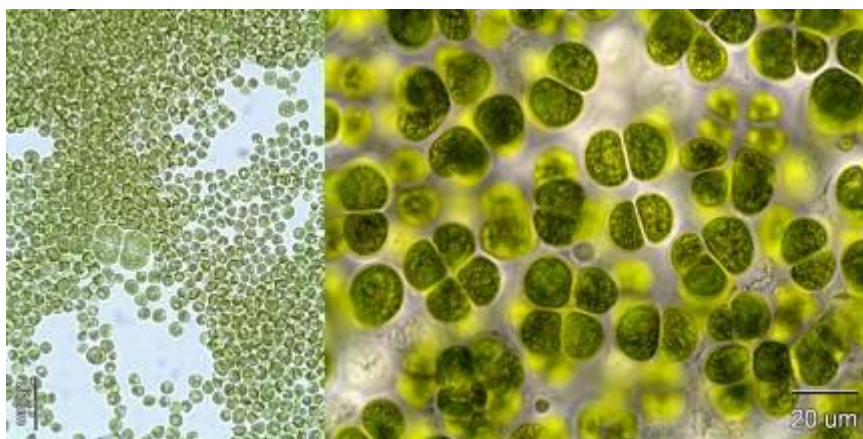
Figure 1. Tetracystis isobilateralis cells and aplanospores.

In this study, the taxon Tetracystis isobilateralis R.M.Brown & H.C. Bold. was used, which was sent to Ege University Microalgae Culture Collection and then given the catalog number MACC63. The light microscope image of the microalgae is shown in Figure 1.